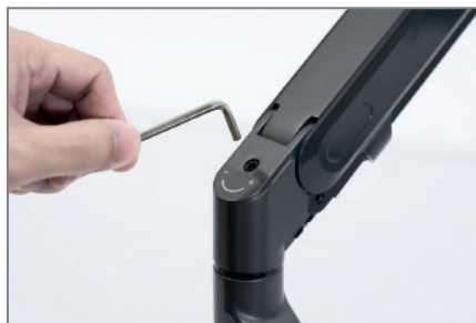
adjustable to device weight