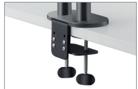
for desktop widths between 10 and 70 mm